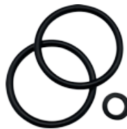
O ring for nozzle